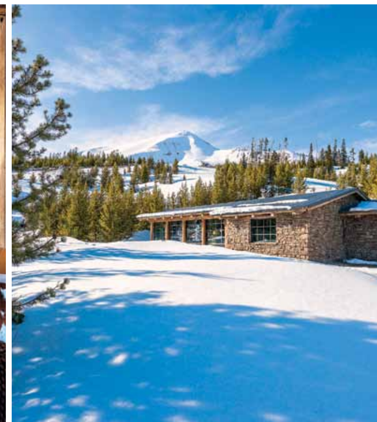
FACING PAGE: The guest bathroom’s ceiling is covered with a “log cloud” composed of random-length sections cut from fallen lodgepole pines on the property, into which are recessed eight LED lights. Wood-grained porcelain tiles, oak cabinets, a steel countertop and antique-style brass faucets enhance the rustic-meets-modern aesthetic. ABOVE, LEFT: A custom chandelier composed of coarse fibers adds a soft, wild touch to the master bedroom’s clean lines. ABOVE, RIGHT: Viewed from across its adjacent meadow, the cabin tucks cozily into a stand of trees and a nearby hillside.