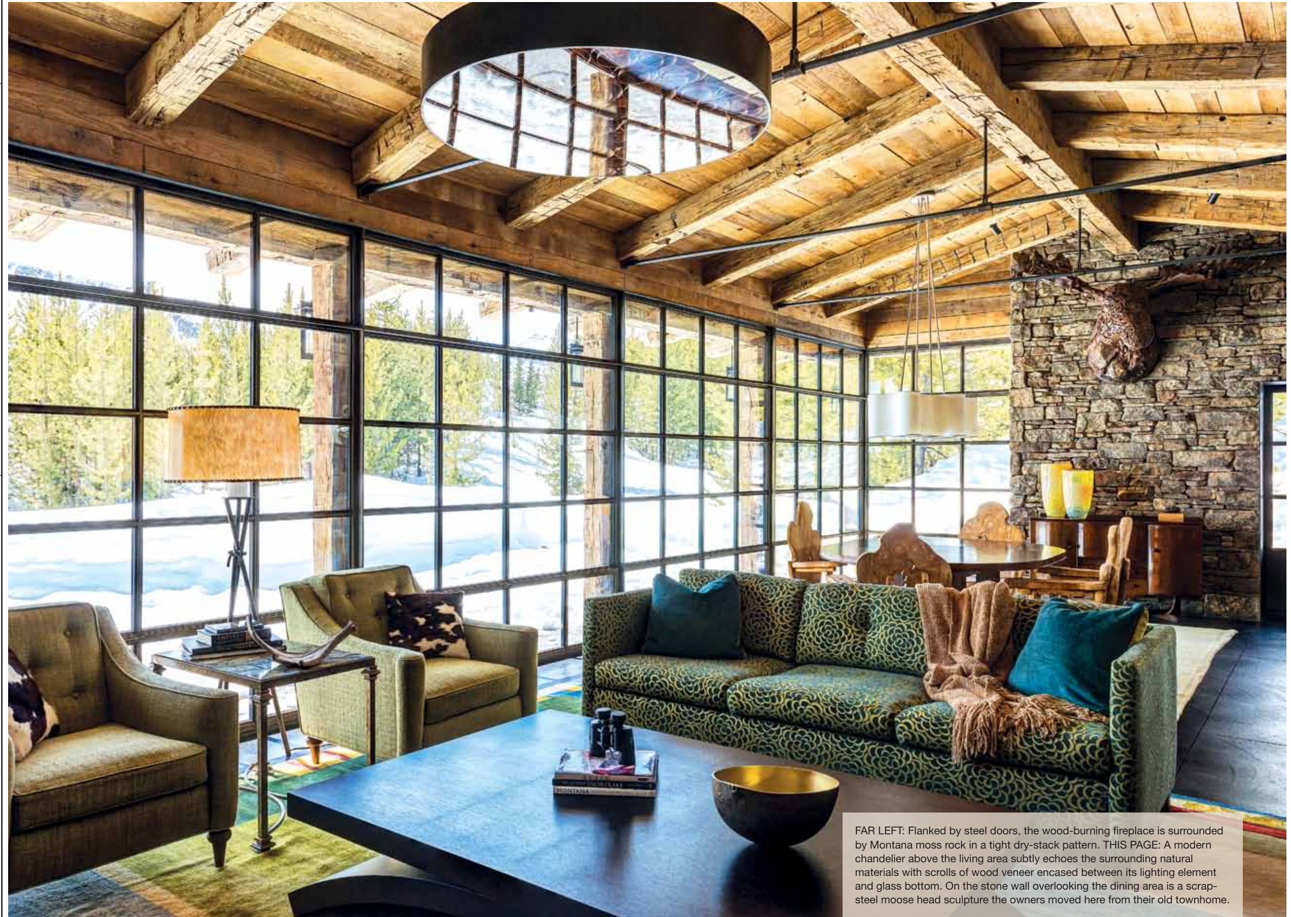
FAR LEFT: Flanked by steel doors, the wood-burning fireplace is surrounded by Montana moss rock in a tight dry-stack pattern. THIS PAGE: A modern chandelier above the living area subtly echoes the surrounding natural materials with scrolls of wood veneer encased between its lighting element and glass bottom. On the stone wall overlooking the dining area is a scrap-steel moose head sculpture the owners moved here from their old townhome.