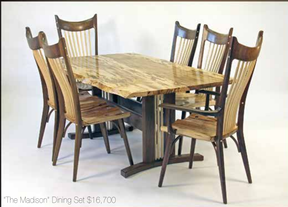
"The Madison" Dining Set $16,700