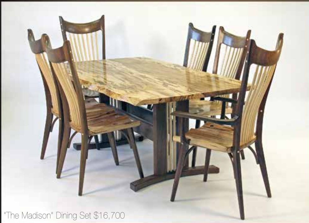
"The Madison" Dining Set $16,700