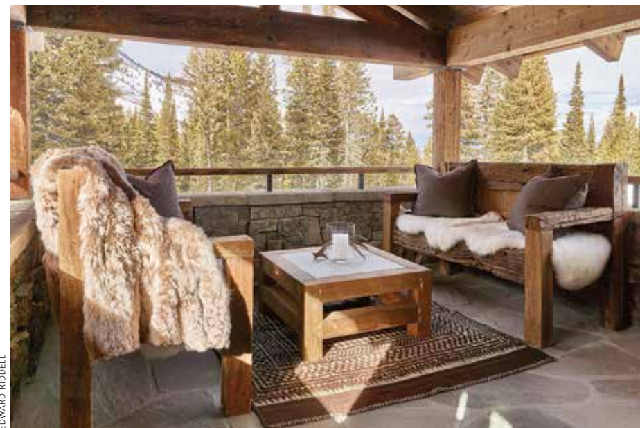
ABOVE: Hand-picked stone stacked to accent different sections of the adjoining buildings adds visual contrast to the vertical lines established by the reclaimed wood siding. BELOW: An outdoor seating area connects to Wyoming’s trapper history with furs as accents to the hewn outdoor furniture.

The house also has ladders from a kid’s room directly to the pool room, a secret